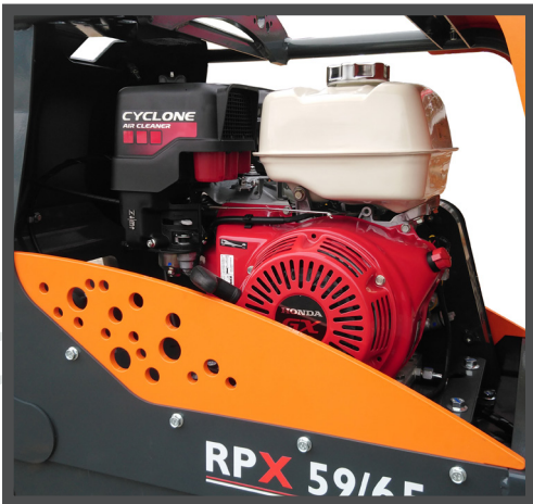
HONDA GX390 (CYCLONE) PETROL ENGINE MODEL AVAILABLE