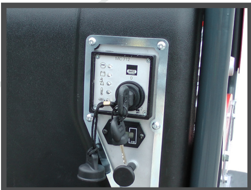
ELECTRIC, KEY IGNITION START & LED WARNING LAMPS (DIESEL ELECTRIC MODEL)