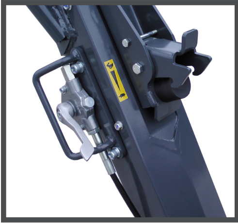
HANDLE MOUNTED THROTTLE, PERFECT FOR THE OPERATOR