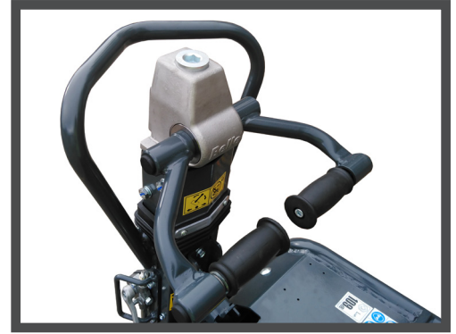
FIXED HANDLE TO AID MANOUVERABILITY