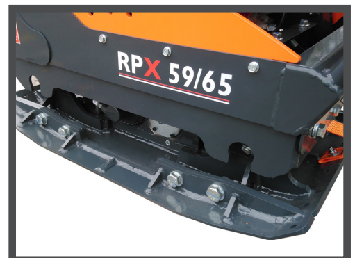
2 X 75MM OR 2 X 125MM BASEPLATE EXTENSION PLATES AVAILABLE AS AN OPTION