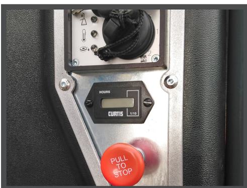
HOURLMETER AS STANDARD ON PETROL & DIESEL ELECTRIC MODELS